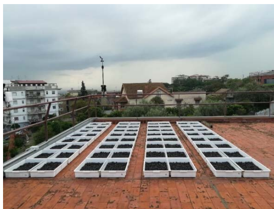
Figure 1: The BR pilot installation

Two adjacent catchment quadrants of the terrace were identified, each characterized by a total surface area of about 26.3 m 2 (4.60 m x 5.72 m). The two quadrants are characterized by a mean slope of about 1.5% and separate roof drain systems (including separate inlet and downspout). One of the two quadrants (Q1) was equipped with a modular BR while the second quadrant (Q2) was left unmodified and used as reference. The BR in Q1 (see Figure 1) was made of 64 tray-modules, disposed in 4 macro-groups of 16 trays each, spaced with corridors of about 0.4 m in width used for system installation and maintenance.